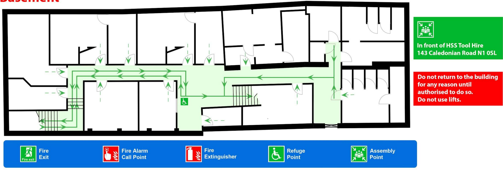
ANNEXE 2 - Fire Evacuation Routes - clueQuest Ltd. New Building 167 Caledonian Road, London, N1 0SL